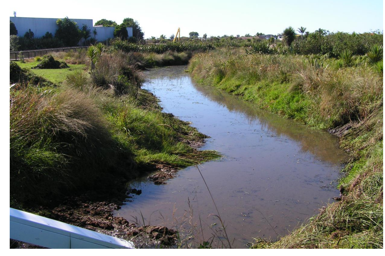
12 February 2024