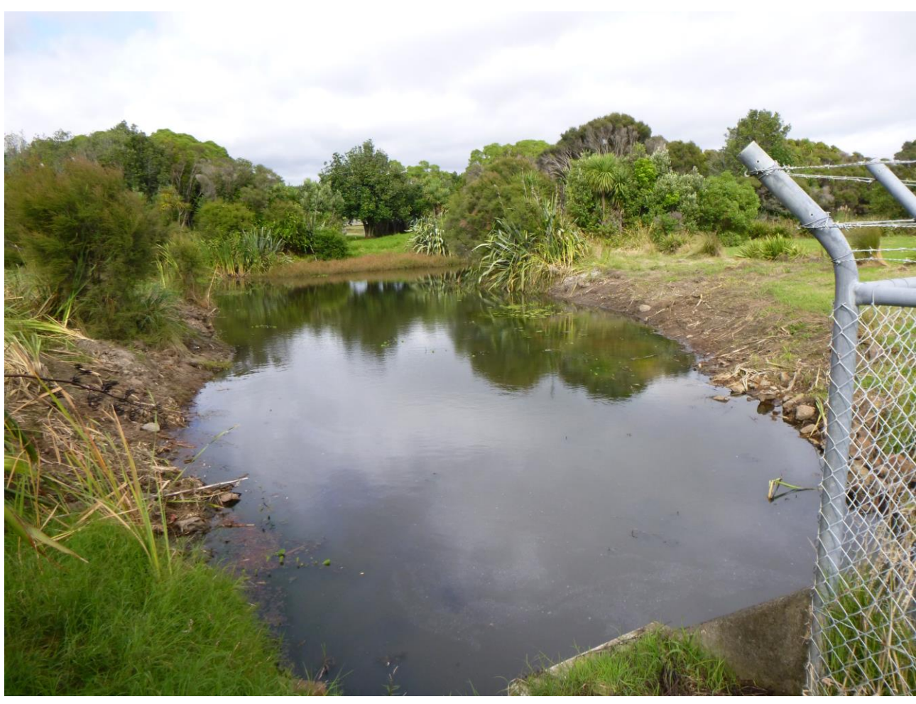
3 February 2024 8 March 2024